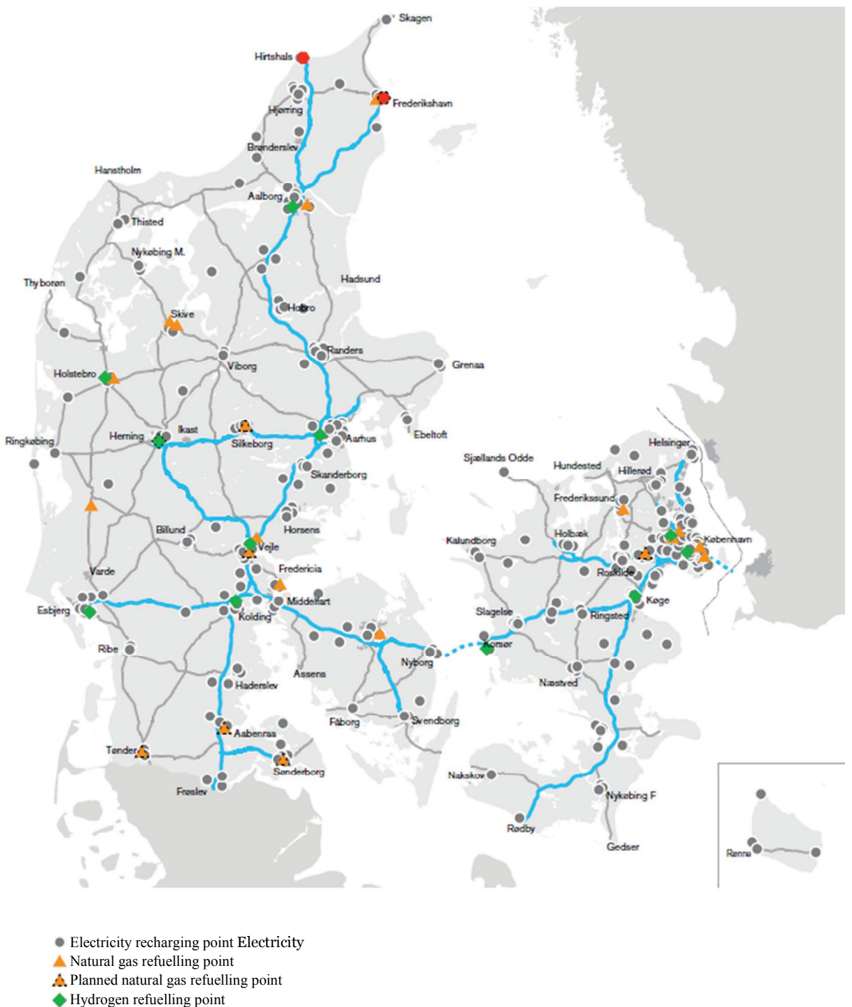
Figure 4 | Map showing the deployment of infrastructure for electricity, natural gas (CNG), hydrogen and liquefied natural gas (LNG) in Denmark.